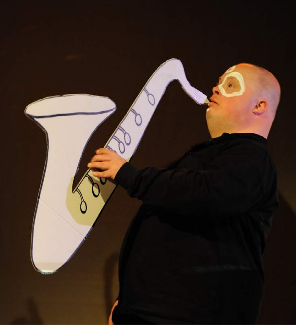
Frog in a Cage at Frankston Arts Centre, 2014, Get Out!