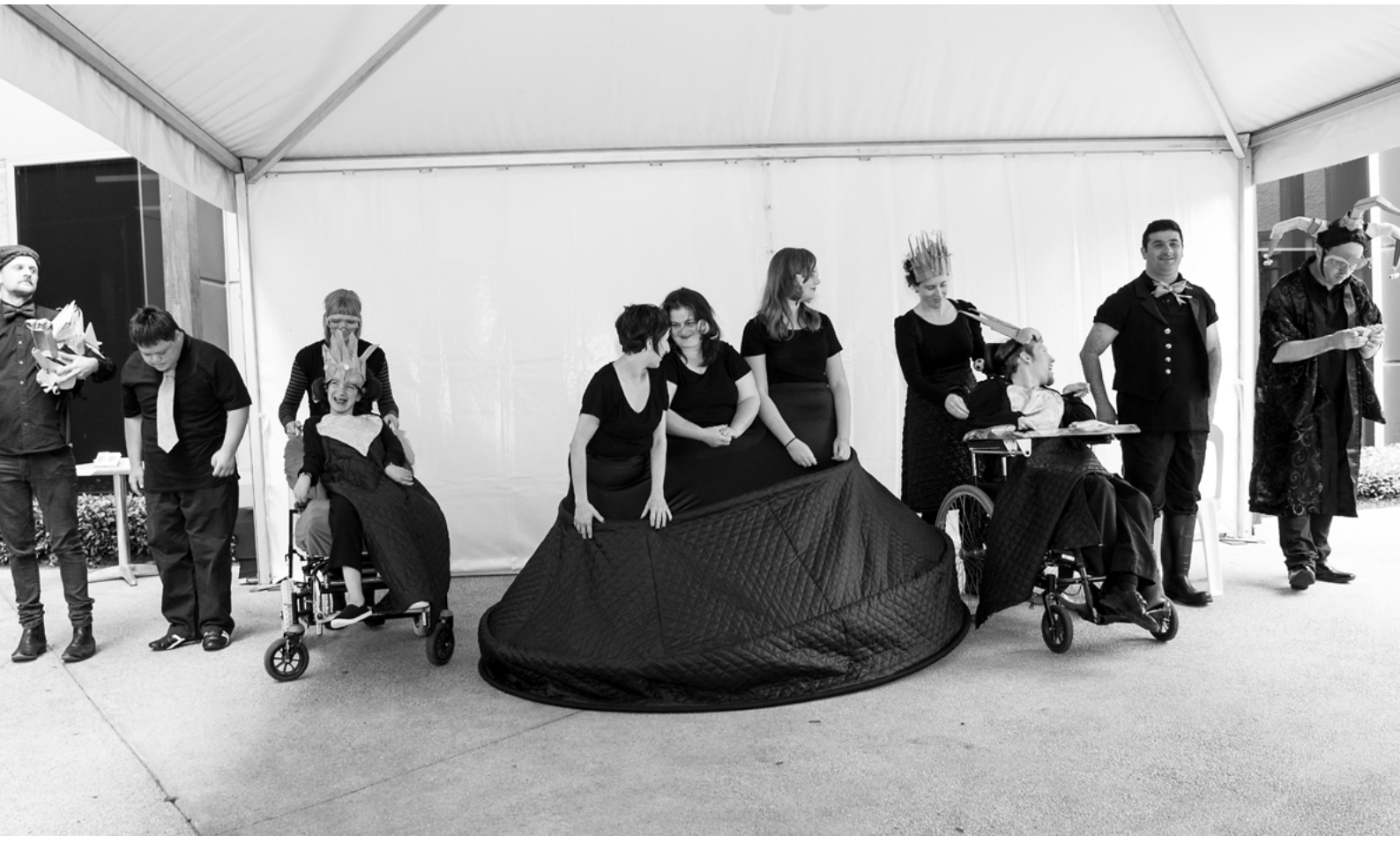
The Feast, 2014, Way Out West.