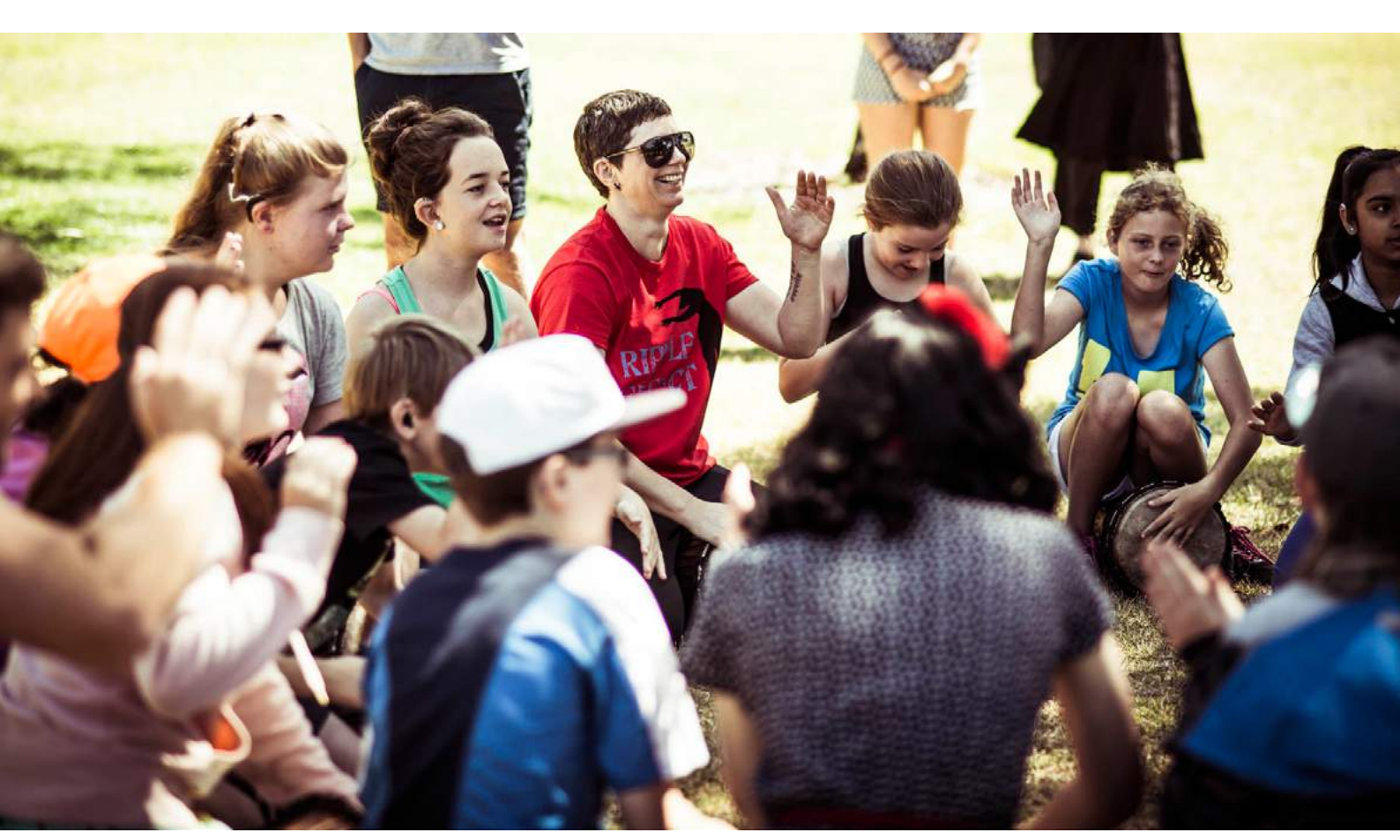
The Ripple Effect workshop, 2014.