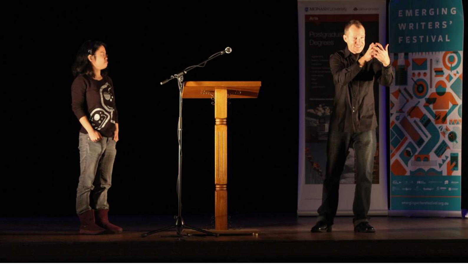
An Auslan interpreted performance at the Melbourne Emerging Writers' Festival, 2013.

documents outline any notion or acknowledgement of separate or different artistic or creative criteria and processes particular to art produced by artists with disability.