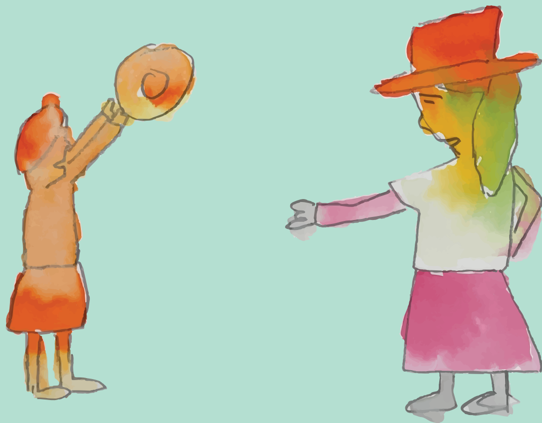
Image: Tony Dowling, untitled, pencil and watercolour on paper, SRS Studios Fusion, 2018.