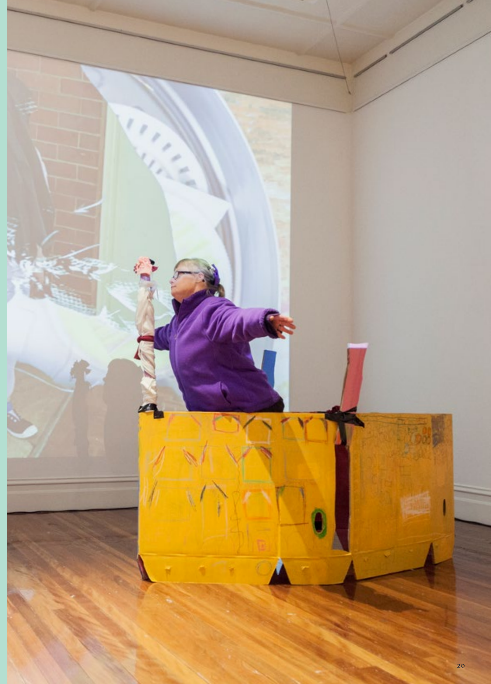
Image: Go Have a Look , exhibition by Art Day South at Kingston Arts Centre.

The Go Have a Look exhibition took place at the Kingston Arts Centre over August and September. The exhibition was a culmination of painted sets, wall works, and multiple video and sound works – a highly saturated immersive environment that juxtaposed the multiplicity of skills and interests that the artists bring to the studio. The gallery entrance became a stage for community announcements and artists used it as a platform to express their frustrations of the world.