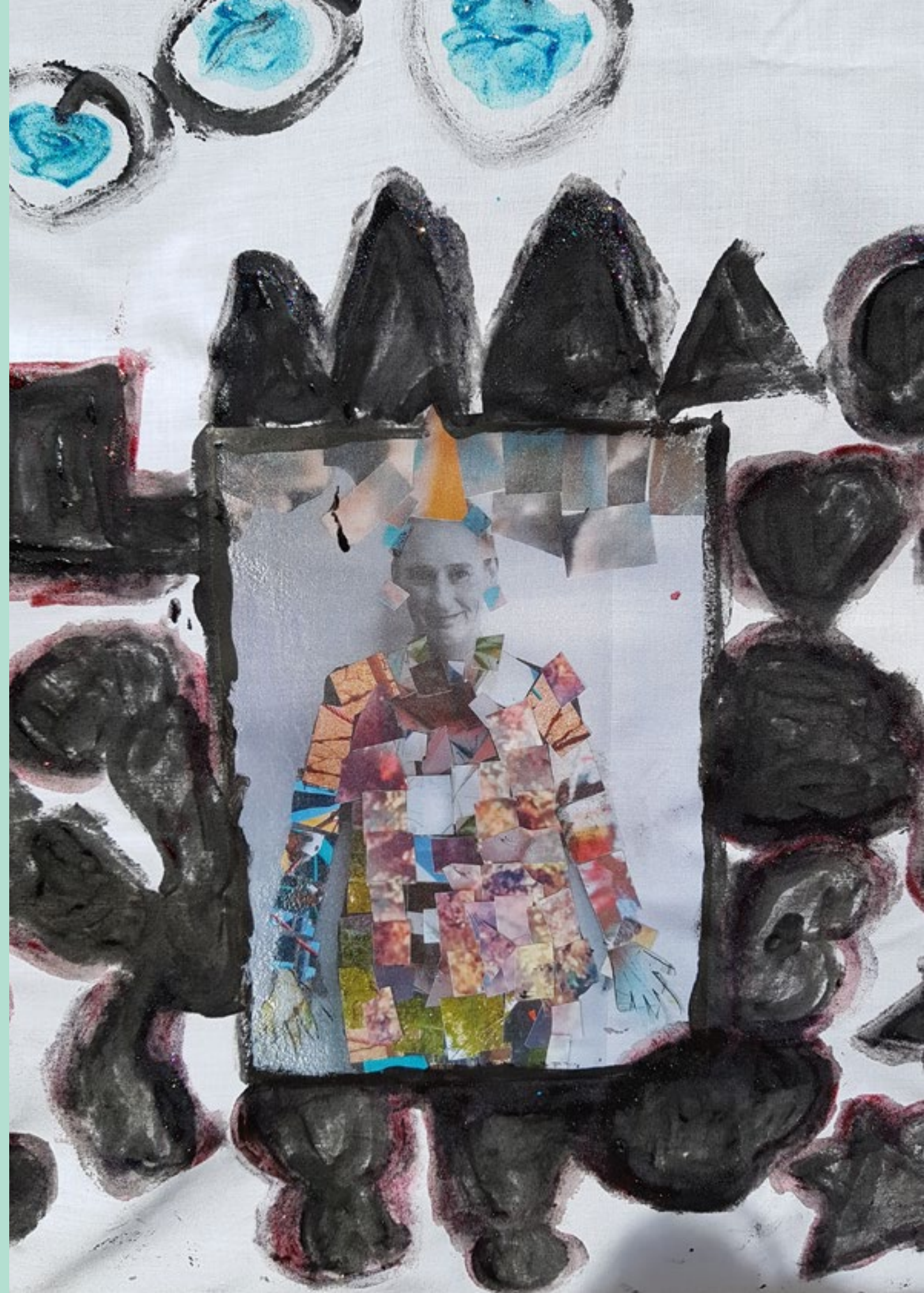
Image: Art About collaborative mural, paint and paper on fabric (detail 3), 2018.

Art About artists were invited to collaborate with Mornington Peninsula based inclusive arts studio Outcrop on a public art mural at 91 Wilsons Road, Mornington . Drawing inspiration from colour, texture and form of the Mornington Peninsula, each Art About artist created their work on individual panels that were brought together to create a greater whole.