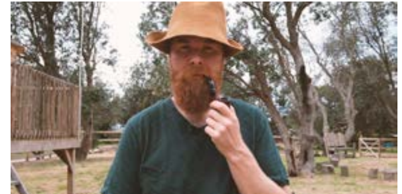
Images (clockwise from top left): 'Little Fledgling' by Walter Kadiki, 2020; 'Resource Daddies' by Nemeses, 2020; 'The Precious Treasure' by Ramas McRae, 2020