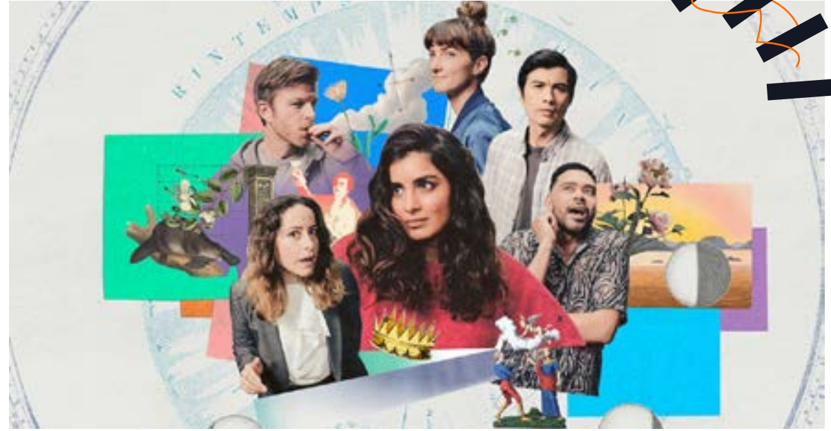
Above image: 'Retrograde', ABC TV

In this panel discussion, presented in partnership with The Wheeler Centre, the creators of 'Retrograde' reflected on what they loved and what they learned while making this groundbreaking show. They also delved into how screen professionals living with disability – who are often more adept at navigating restrictions on social and workplace activity – can lead the way when it comes to innovative production, both during the pandemic and beyond.